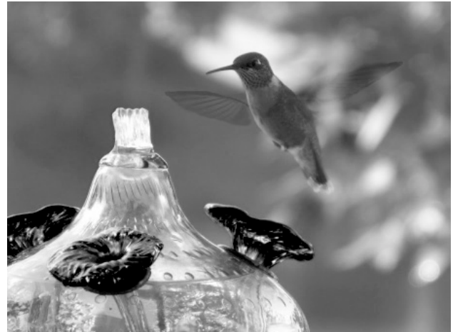
Above photo represents September in the new calendar.