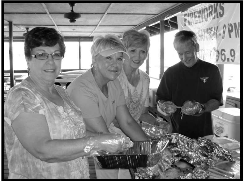
H.O.B.O. Picnic 2012