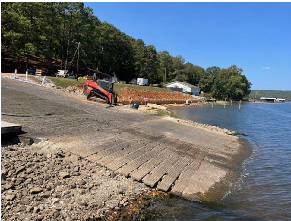
Photo of Higgins Ferry Park during the drawdown (construction of 225 foot seawall in background)

The Browns wish you all a Blessed Winter, Merry Christmas & a Happy 2024