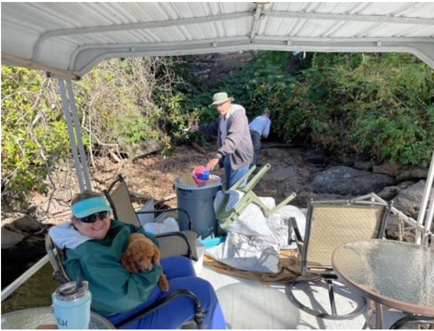
Photos from Annual Meeting in November.