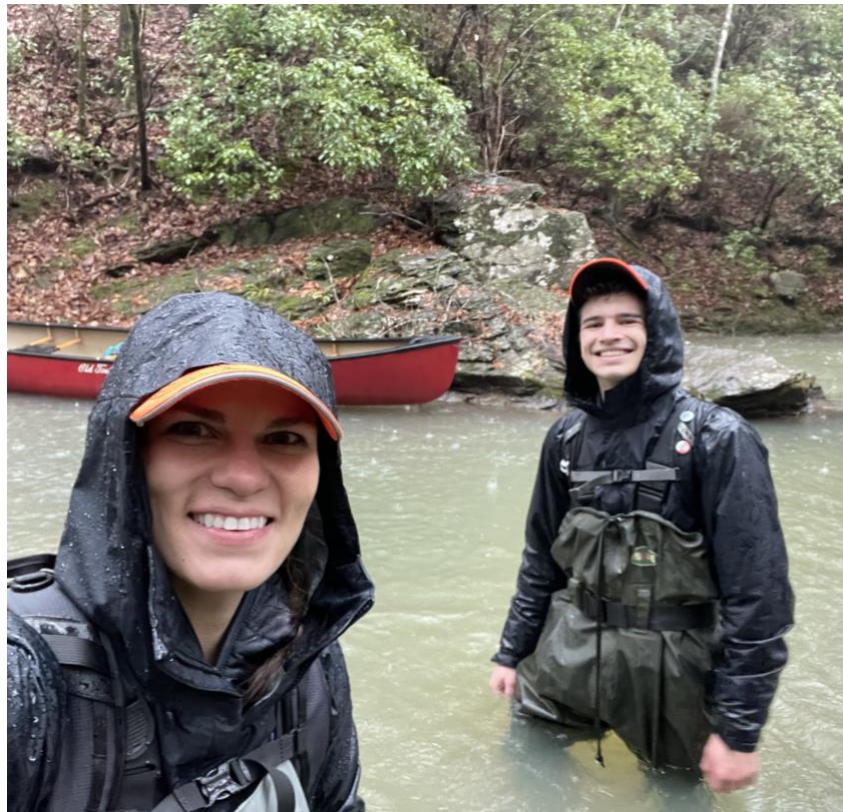
(photo of Coosa Riverkeeper personnel onsite checking erosion status)

LAKE MITCHELL DRAWDOWN REMINDER: Drawdown will be September 25-27. Refill will begin Oct 9 with the lake back to full elevation on Oct 11. Make sure you have permits in place for any repairs or construction during this time.