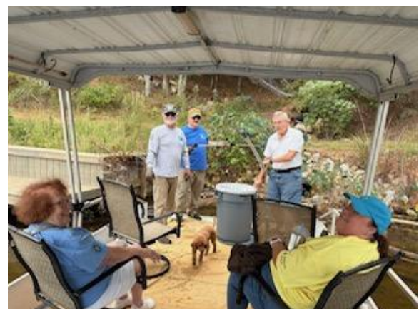
(Team work makes the dream work)