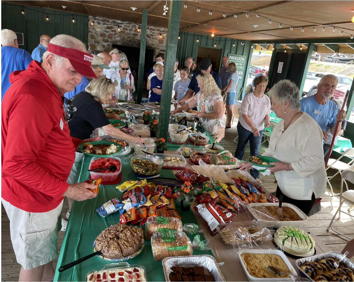
(What a beautiful spread of food shared by our lake neighbors – everyone has a great time!)