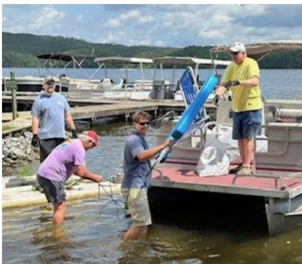
(Unloading from another great day of cleaning up)