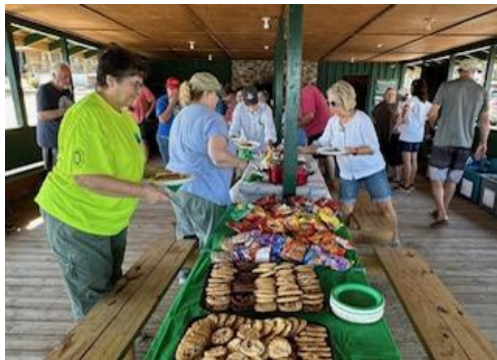
(picnic after the clean-up – enjoyed by all)