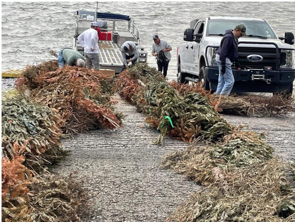
(Assembling fish habitats to be loaded on barge.)