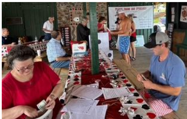
(Lots of workers are needed to make the Poker Run a success.)