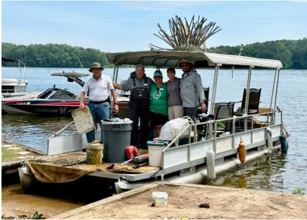
Just one of the many boats participating in the Cleanup